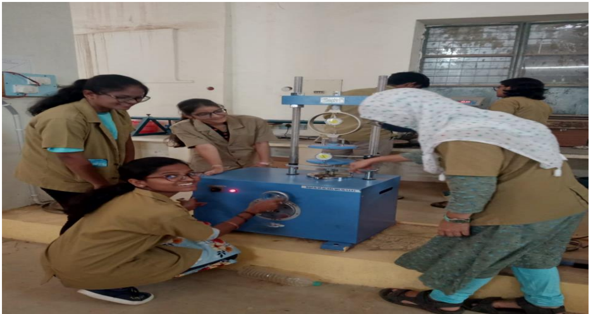
Geo Technical Engineering lab-II