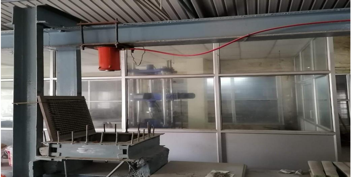
Slab Testing Machine