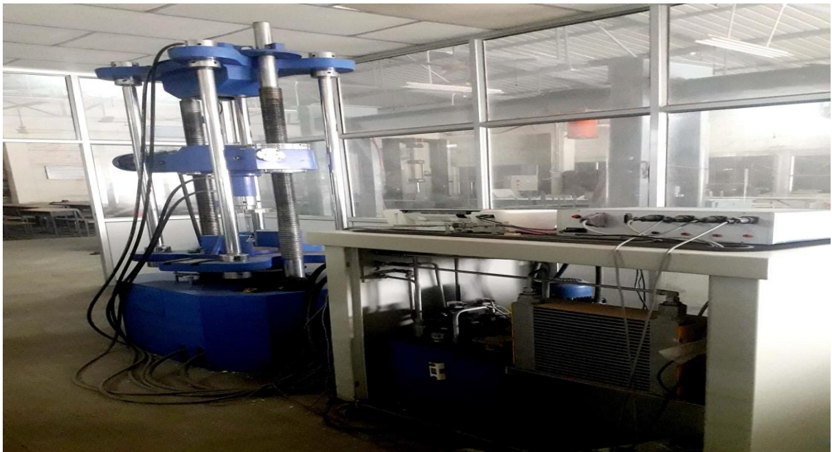
Universal Testing Machine